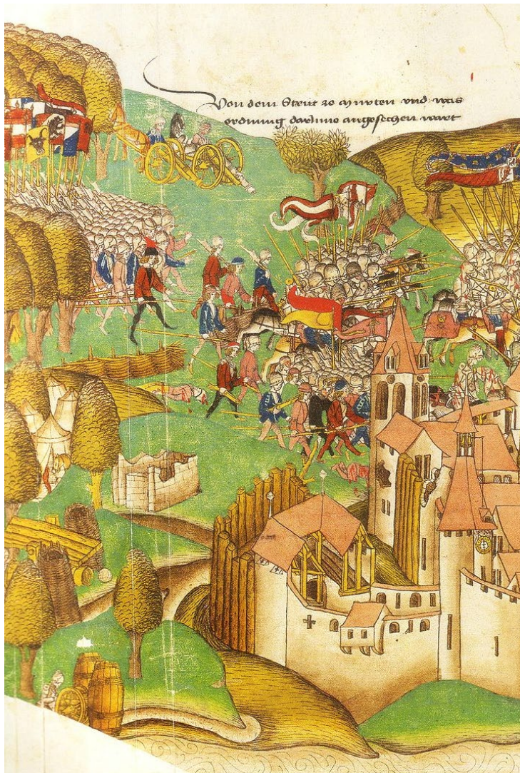
The 1476 Battle of Morat (Murten), illustration from the Zürcher Schilling (1480/1484). In this battle, Charles the Bold was decisively defeated by the Swiss Confederate Army

inhabitants of the local mountains, and especially Ursula, whose son is saved from certain death by El Solitario, laud his virtues. Prince Palzo arrives at Underlach intent on asking for Elodia's hand. She refuses to follow the advice of Father Anselmo, who counsels her to accept the Prince's offer in marriage. Ecberto (Ecbert), Count of Norindall, whose amorous interest in Elodia had gone unrequited, decides to join Palzo in his desire to take revenge on her and on El Solitario. However, just as Ecberto is trying to kill Elodia, El Solitario appears, ready to take Elodia away, and makes himself known to Ecberto, who recognizes him as his old brother-in-arms, whom he had thought long dead. Upon this discovery, Ecberto changes sides and decides to help Carlos, but upon the arrival of Palzo's troops, Carlos has to escape, alone. In the final act, just as Palzo is getting ready to marry Elodia, El Solitario arrives dressed as a ghost. In the commotion that follows, Ecberto kills Palzo. Ecberto then persuades Father Anselmo to marry Elodia to El Solitario (whose identity is unknown to all present except Ecberto). After being questioned by the priest, the mysterious ghost reveals himself as Carlos (Charles) of Burgundy. In horror,