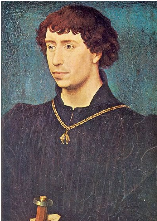
Portrait of Charles the Bold, by Rogier van der Weyden (1399/1400–1464).

This opera, in three acts, and sung in Italian, with libretto by César Perini, was based on a popular XIX century novella of the same title by French romantic writer Charles-Victor Prévot, vicomte d'Arincourt (1788-1856). “Il Solitario” premiered in 1841 in Cádiz and soon thereafter in Sevilla, Madrid, and Pamplona to enormous acclaim. In Sevilla, for example, “Il Solitario” had 17 performances in just three months. The success of this work led critics to compare Eslava to many of the greatest opera composers of the time and showered him with much acclaim. In these excerpts it is easy to see why: These are beautiful, romantic melodies with flowing accompaniments and a great dramatic sense. Sadly, most of the opera score and the vast majority of the music from Eslava’s subsequent two operas, “La Tregua di Ptolemaide” (1842) and “Pietro il Crudele” (1843) have probably been lost forever. The excerpts shared here are drawn from a few scanned contemporary prints and manuscripts kept at the National Library of Spain (Biblioteca Nacional de España) in Madrid.